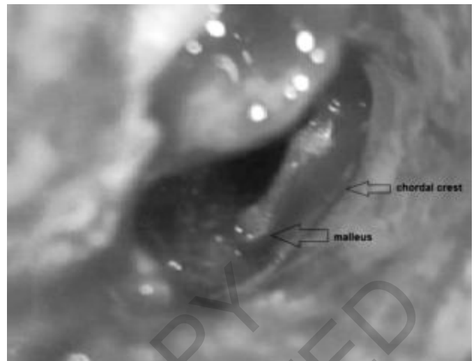
Fig. 2: View of middle ear during microscopic tympanoplasty(chorda tympani nerve not manipulated).

metallic taste in the mouth was reported by 7 patients (10.6%): 1 in group 1 (4%) and 6 in group 2 (14.6%) ( p=0.29 ). Ageusia/hypogeusia was reported by 4 patients (6%) in group 2 (37.4%) but none in group 1 ( p=0.28 ). (Table I). Tongue numbness was reported by 2 patients in group 2 (5%) but none in group 1 ( p=0.52 ) (Table I). No patients had xerostomia. No patients had more than one symptom of CTN damage.